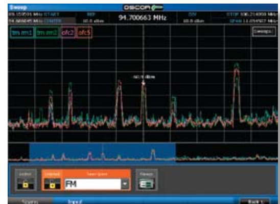
Zoom to a frequency range while continuing full peak capture